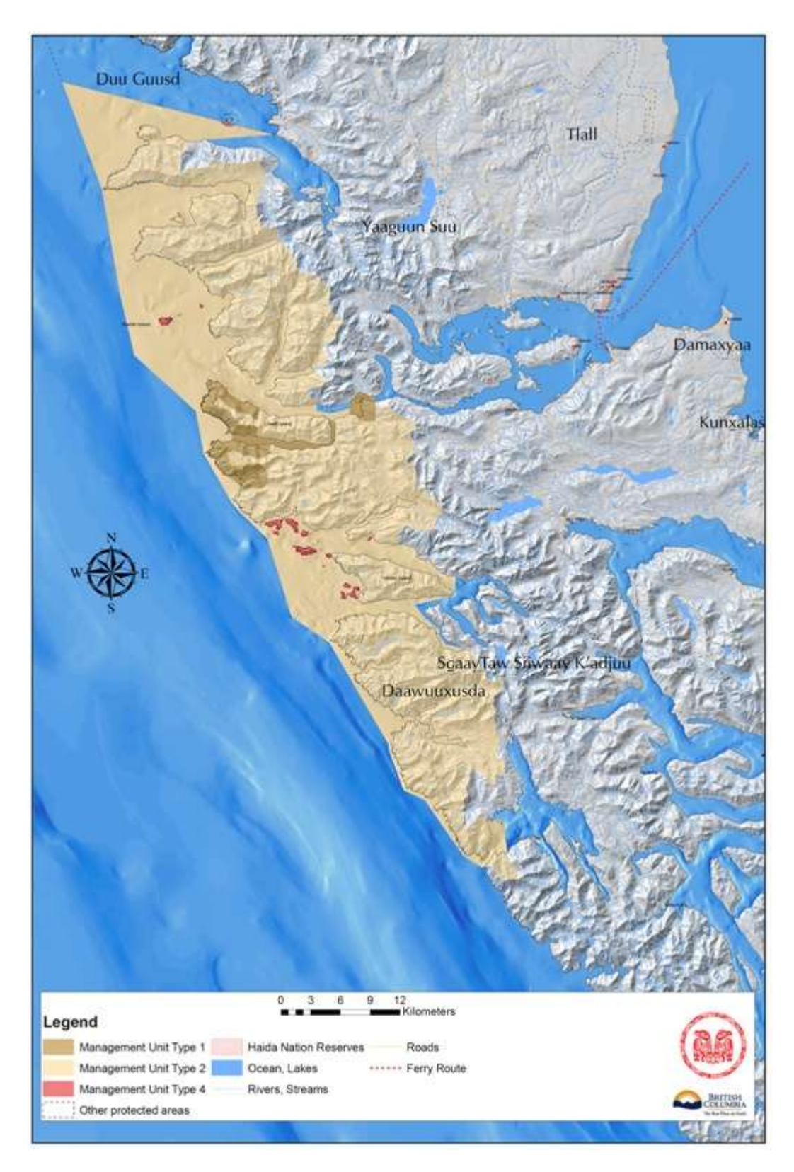
Figure 3. Daawuuxusda Management Zone Map