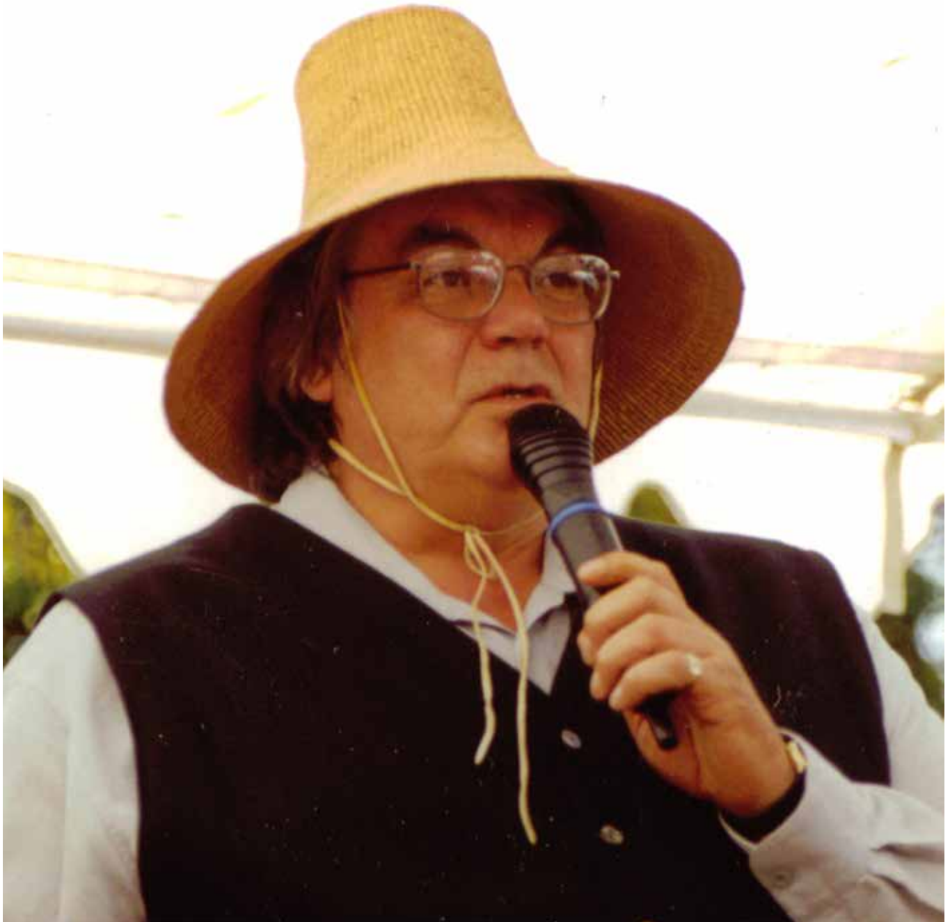
Skilay created the first Haida Gwaii Youth Assembly in 1993 and was a strong speaker. Skilay dedicated many years working to advance the rights and title of the nation.